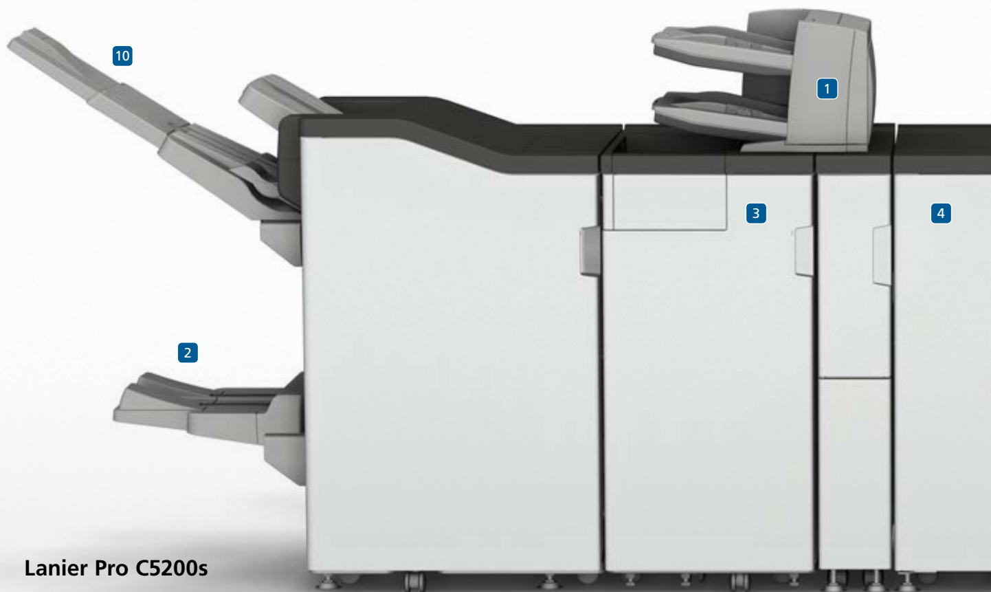
Lanier Pro C5200s